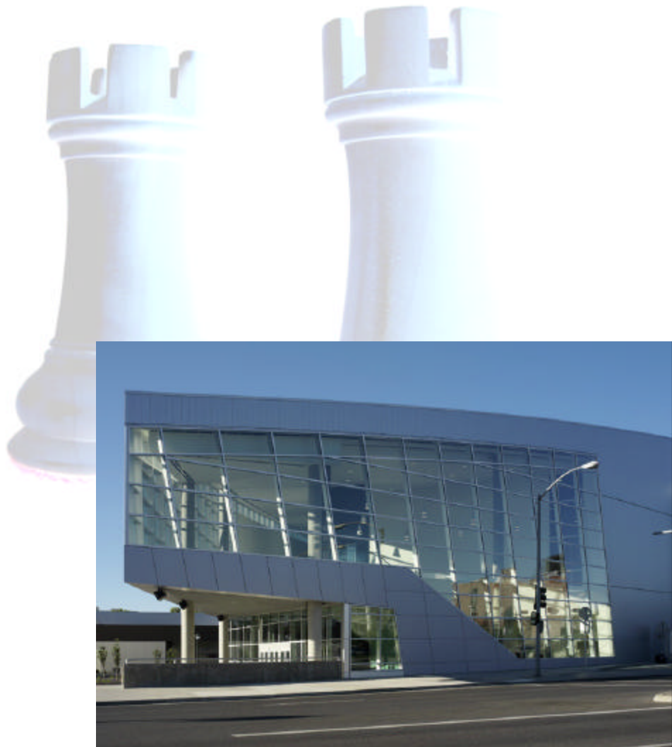
Spokane Convention Center

Bid Proposal 2009 Washington State Elementary Chess Championships April 25, 2009